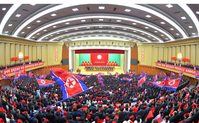
The Ninth Congress of the General Federation of Trade Unions of Korea is held in Pyongyang on May 11 and 12.