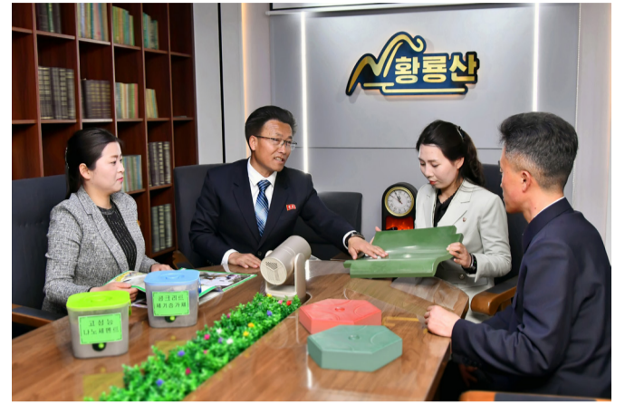
Officials hold a discussion to develop green building materials at the Phyongsong City Hwangryongsan Green Technology Exchange Company.