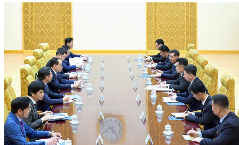
Kim Song Nam, secretary of the WPK Central Committee and director of its International Department, meets Le Hoai Trung, the special envoy of the general secretary of the CPV Central Committee who is president of the Socialist Republic of Vietnam, at the Pyongyang Assembly Hall on May 13.

At the talks both sides agreed to further deepen exchange and cooperation between the two countries in various fields and strengthen strategic communication and