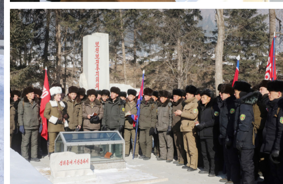
Many people take part in the study tours of the revolutionary battle sites in the area of Mt Paektu to learn the fighting spirit of anti-Japanese revolutionary fighters.