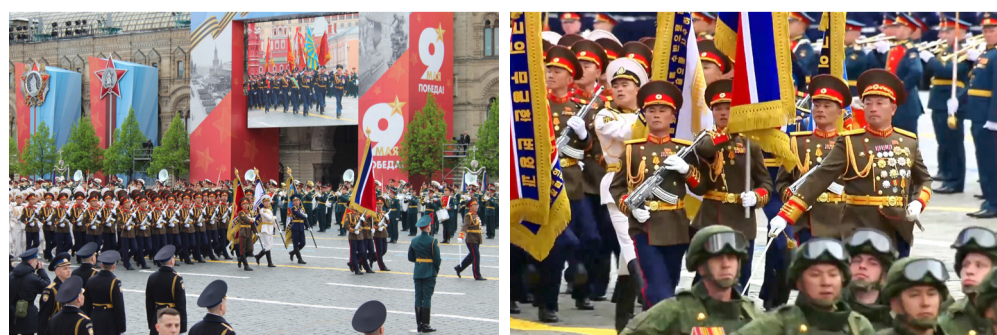
Led by Senior Colonel Choe Yong Hun, the mixed column of KPA three services marches through Red Square.