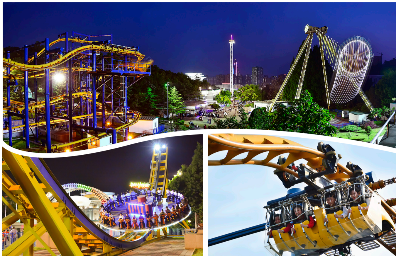
People enjoy a fun time at the Amusement Park of Kaeson Youth Park.

younger for the enjoyable environment," said an old man, who came there with his grandchildren.